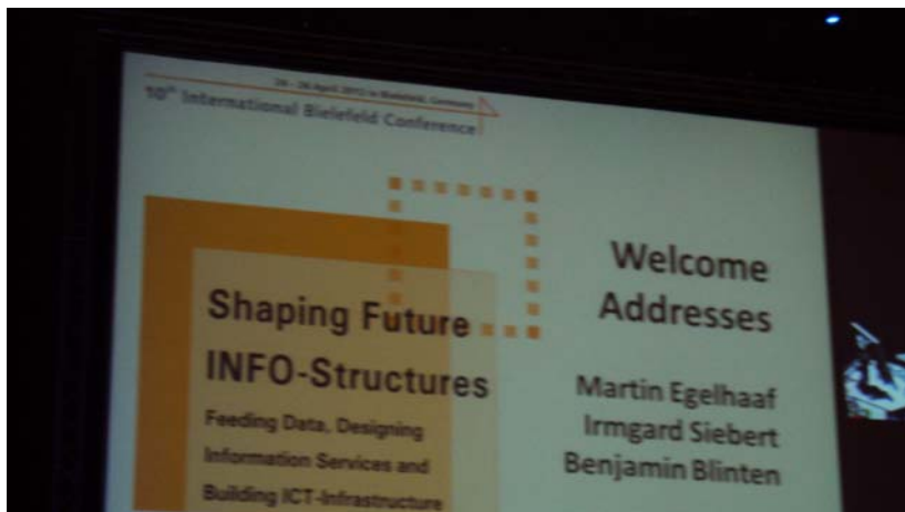
Picture of the beginning of the conference

The Conference commenced on April 24 th , 2012 in the afternoon with the Welcome addresses conveyed by four persons.