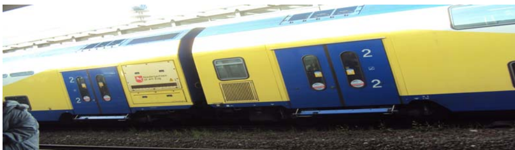
At Bielefeld Train Station: before my departure to Hannover