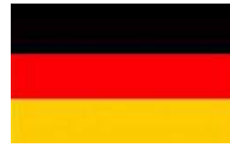
REPUBLIC OF GERMANY

24 - 26 April 2012 in Bielefeld, Germany 10 th International Bielefeld Conference