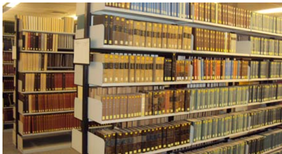
Visiting University Bielefeld Library