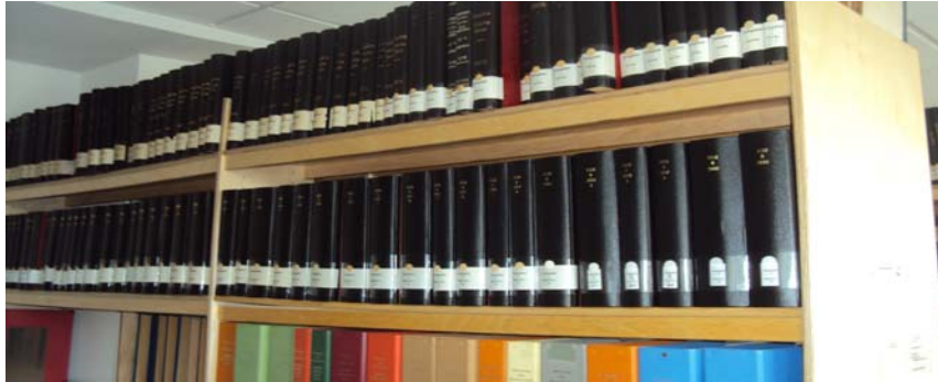
Library of Bielefeld District Appeal Court