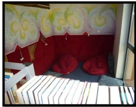
Children's Floor -Public Library of Bremen

By the young readers' interest, the library also created a website "rabe-kessi.de". Launched in 2009, aimed for children, the site is specialized telling a story of the mascot crow Kathy. All information about the library and reading tips are presented in this site, via a lively and lovely way. The site is initially developed together by the library and a company, then maintained by an intern, simply by deeply loved by children. The crow dolls then became the mascot of Public Library of Bremen