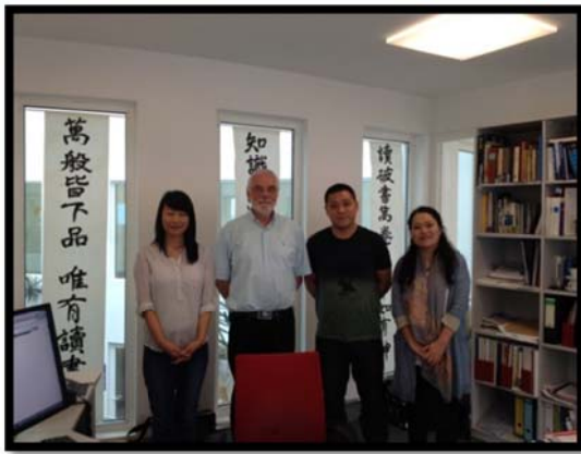
Photo with AWI staff

The library of Alfred Wegener Institute(AWI) polar ocean institution is located in the famous "city of science" Bremerhaven, with 60 kilometers from Bremen. It provides services for the scientists of the institution, so 95% book funding is used for purchasing electronic journals, only 5% used for paper documents. All service is provided via self-service that there is no staffs in the library, the actions of borrowing and returning are all processed and recorded in an information form. Readers can leave a message if have any other requirement, later the staff will take the initiative to contact the reader. One special service is to provide academic level analysis for the researchers in AWI. In addition, the library also has a branch in the Antarctic providing service for the scientific researchers.