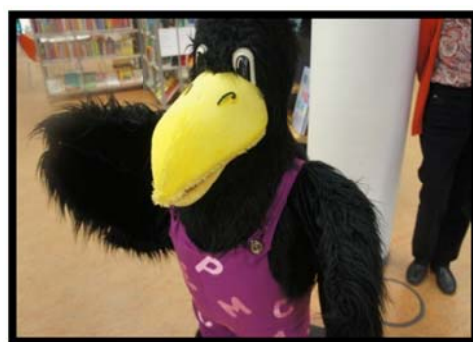
mascot - Public Library of Bremen