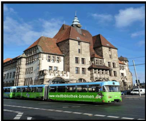
Public Library of Bremen

Public Library of Bremen is positioning itself as a place where readers spend for their lifelong learning. It constantly enhances reader's reading abilities through comprehensive service as well as provides related training of leisure and vocational education for readers. The library hopes to show its functionality, creativity, and attractiveness by holding various events.