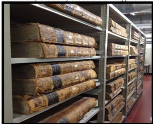
Ancient books in SuUB

SuUB library system is composed by a central library and several branch libraries in various departments and higher education institutions which located in or near Bremen and Bremen Heaven. At the same time, SuUB's network also provides database, e-book, electronic magazine for a large number of colleges in this city.