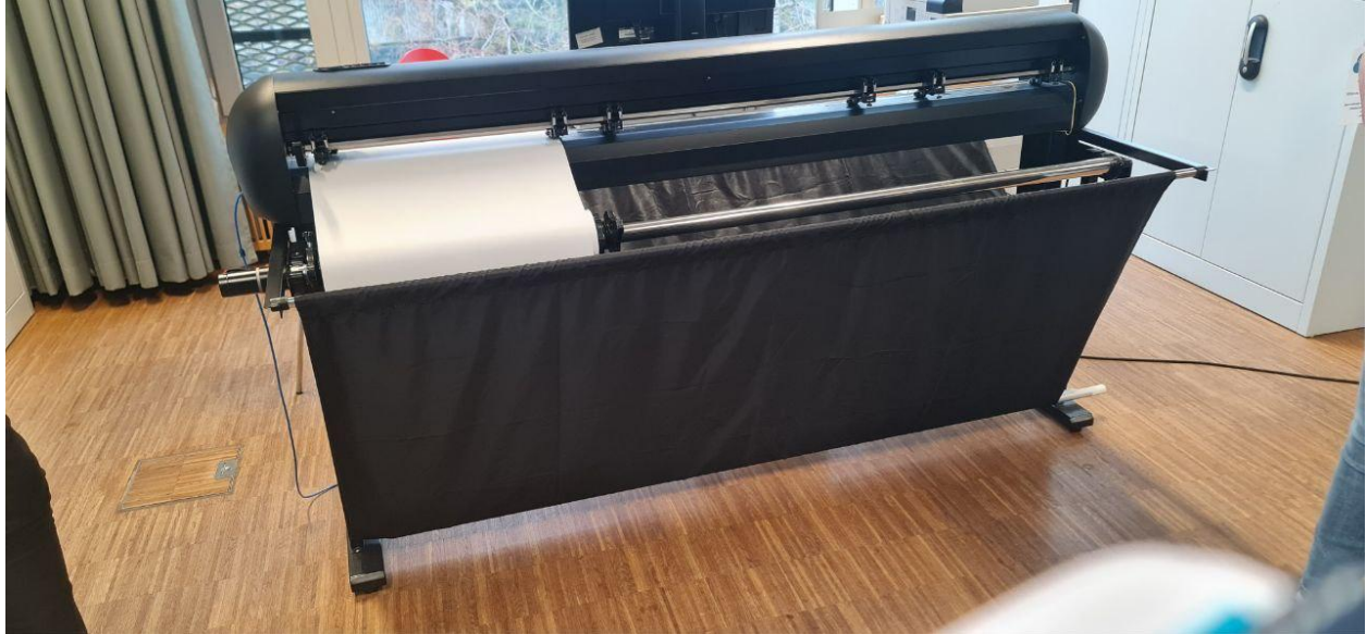
Photo: Makers' space room